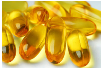
Fish oil, omega 3.

By KIM ARCHER World Staff Writer Published: 7/5/2009 2:22 AM Last Modified: 7/5/2009 4:24 AM